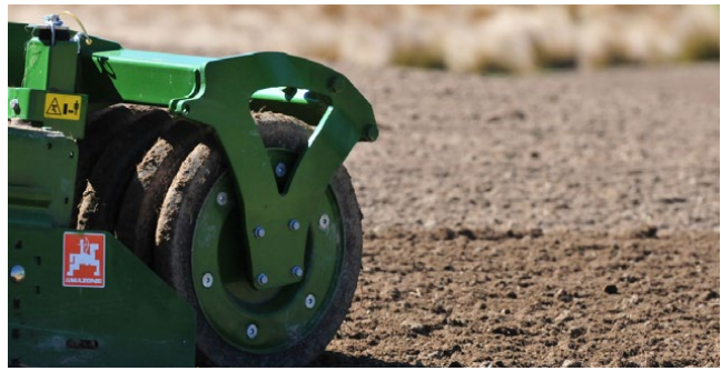
Figure 2. A winter feed crop paddock being cultivated and sown.