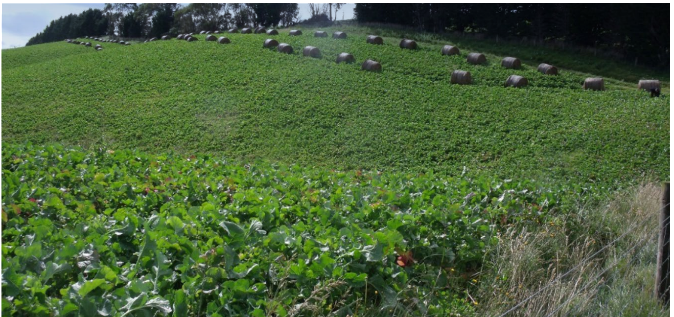
Figure 1. Supplementary feed placed in a crop paddock prior to grazing when the soil is still dry. This minimises heavy vehicle use on wet soils in winter.